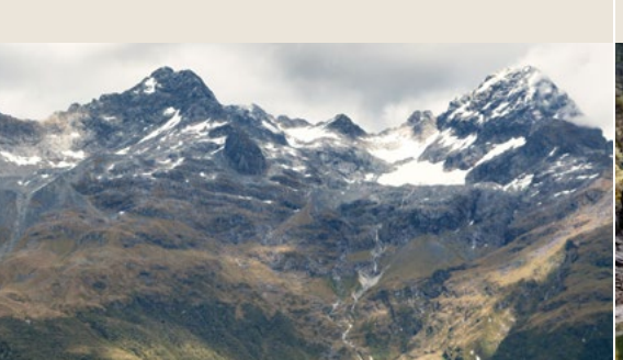
Day 2: Routeburn Falls Hut to Lake Mackenzie Hut